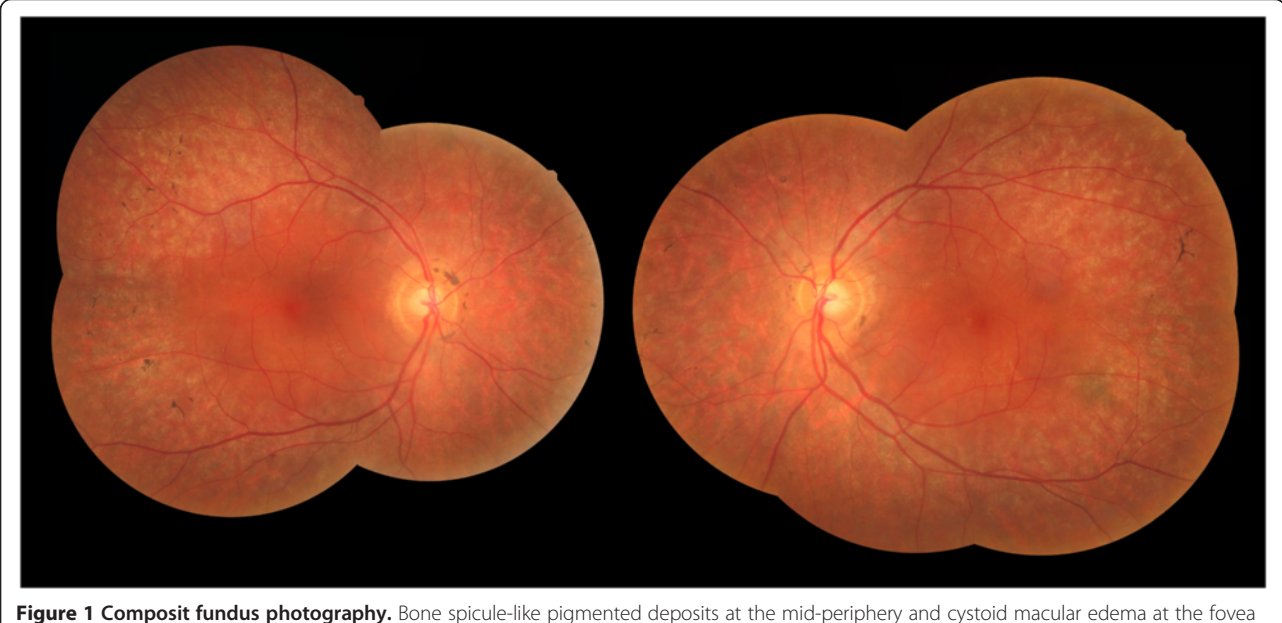
Figure 1 Composit fundus photography. Bone spicule-like pigmented deposits at the mid-periphery and cystoid macular edema at the figure 1 composit fundus photography. Bone spicule-like pigmented deposits at the mid-periphery and cystoid macular edema at the figure 1 composite fundus photography.

but relatively intact underneath the fovea and absent outside this area. Retinal thickness was increased in the center of the macula according to the edema and subnormal outside the perifoveal area. There was no evidence of vitreo-retinal interface, retinal pigment epithelium (RPE) or sub-RPE abnormalities on the images.