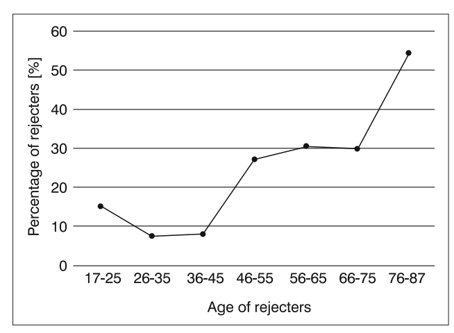
Fig. 1. Percentage of patients that refuse to have more information on their disease by patients' age (N=268)

The majority of the responders do not use their right to access medical records, as only 9.0% (N = 19) had asked to see the documentation about any of their previous medical treatment and 1.2% (N = 3) had had it copied for them. 34.7% of the responders (N = 86) were not aware of the fact that they could ask for a copy of their medical records and 18.4% of them did not know that they could access their medical records.