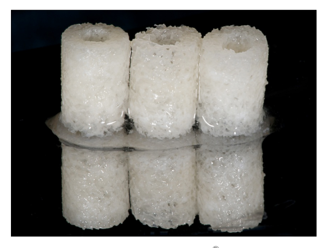
Fig. 3. Allogen human bone rings (maxgraft<sup>®</sup> bonering, botiss biomaterials, Germany) with preserved biomechanical properties: Sterile without antigenic effects, Storable at room temperature for 5 years, Osteoconductive properties supporting natural and controlled tissue remodeling.

Primary parameter of the study will be new bone formation (NBF) including the histological assessment. Secondary parameters will be volume of the augmentate and bone height, see details.