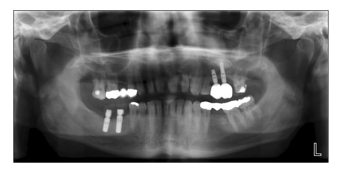
Fig. 4. X-ray situation after loading and finally clinical result with placed implants and superconstruction.

mixed. The bonering was introduced vertically into the maxillary sinus. It stabilizes the implant by buttressing them. The cortical portion of the rings was aligned cranially since this makes adaptation of the cancellous portion of the ring to the concave-shaped sinus floor much easier. The still existing cavity is filled with bone regeneration material. By screwing in a membrane screw, the bone ring is stabilized within the sinus and the implant is anchored in a primary stable position. This procedure enables good results with long-term effects. For harvesting the stem cell-containing subepithelial connective tissue graft from the palate a horizontal incision to the bone will be made 5 mm from the palatal gingival margin and the micro-blade will be subsequently placed parallel to the long axis of the roots. Another horizontal incision will be made 2 mm coronal to the first incision and the periosteum will be dissected before removing the wedge of soft tissue. An approximately 10×6 mm subepithelial connective tissue graft (SCTG) has been harvested from the palate in the second premolar to second molar region as the source of ecto-mesenchymal stem cells. The SCTG trimmed precisely to adapt to the recipient site. X-ray shows the situation after loading (Fig. 4) and finally clinical result with placed implants and superconstruction.