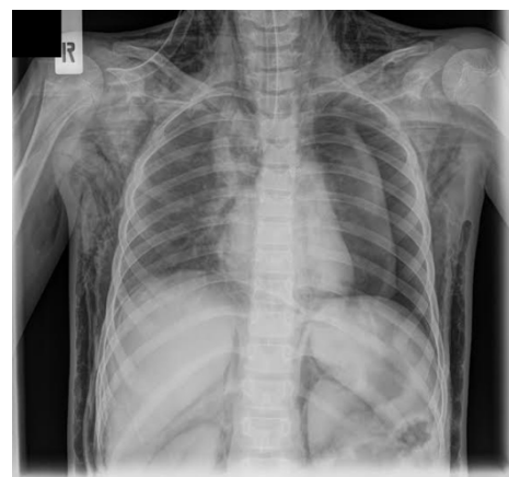
Figure 1: Urgent chest imaging studies revealed left-sided PTX and pneumomediastinum. Neck and chest subcutan emphysema was visible.

adalimumab medication. Therefore she underwent a diagnostic gastro- and colonoscopy prior to a planned total colectomy. Colonoscopy revealed severe inflammation, pseudopolyps and granulated layer throughout the entire colon and ulceration of the distal part of the colon was prominent. After colonoscopy the patient developed acute respiratory failure. Subcutan emphysema was palpable in her face, neck and chest. The patient was moved to Pediatric Intensive Care Unit (PICU). On admission her vital parameters were unstable, she suffered from extreme chest discomfort and decreased air entry was audible on the left side of her chest.