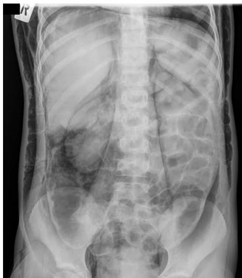
Figure 2: Urgent abdominal imaging studies revealed an extended pneumoperitoneum with retroperitoneal free air. Abdominal subcutan emphysema was visible.