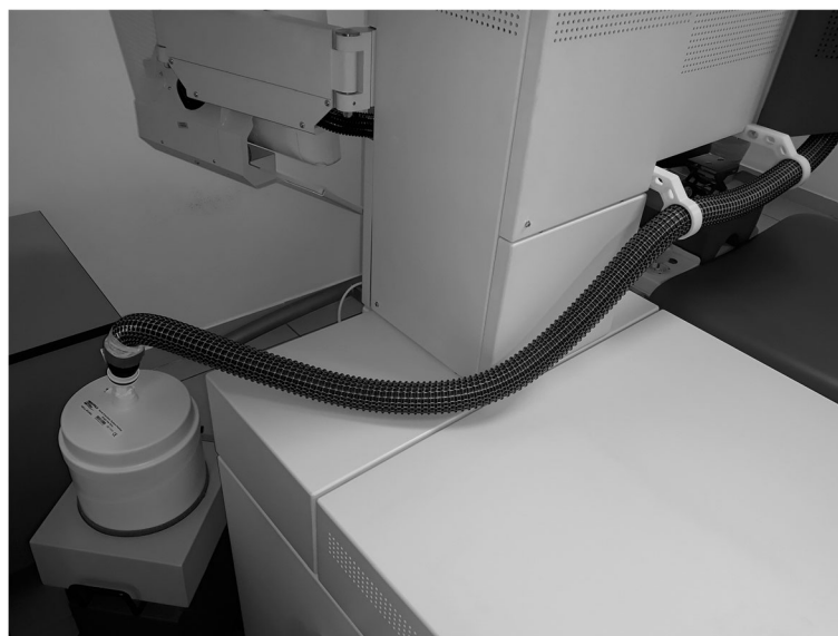
Fig. 1 Photo about the experimental layout of the study

Airflow speed was measured after the evacuator was set to a certain step. 150 \mu\text{m} PTK treatments were performed in 8 mm diameter on three PMMA plates without changing the setting of the evacuator. After finishing three treatments on the same level of suction speed, the airflow was measured again to find out, if the airflow speed was changed during the treatments. This