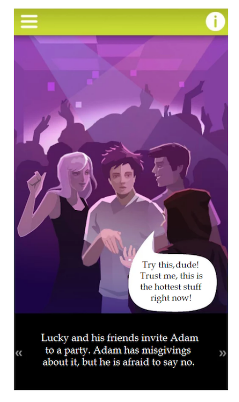
Figure 2. Visual appearance of the What if? roleplay game module.

Figure 1. Visual appearance of the animated comics module.