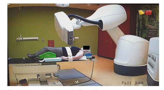
Fig. 1 S-APBI with M6 Cyberknife machine

applied to all patients, 26 patients (96.6%) received aromatase inhibitors or goserelin acetate and tamoxifen in 1 case (3.4%). Within 7–14 days after the completion of CK-SAPBI, the acute side effects were recorded according to the Radiation Therapy Oncology Group/European Society for Therapeutic Radiology and Oncology (RTOG/EORTC) scoring system [40].