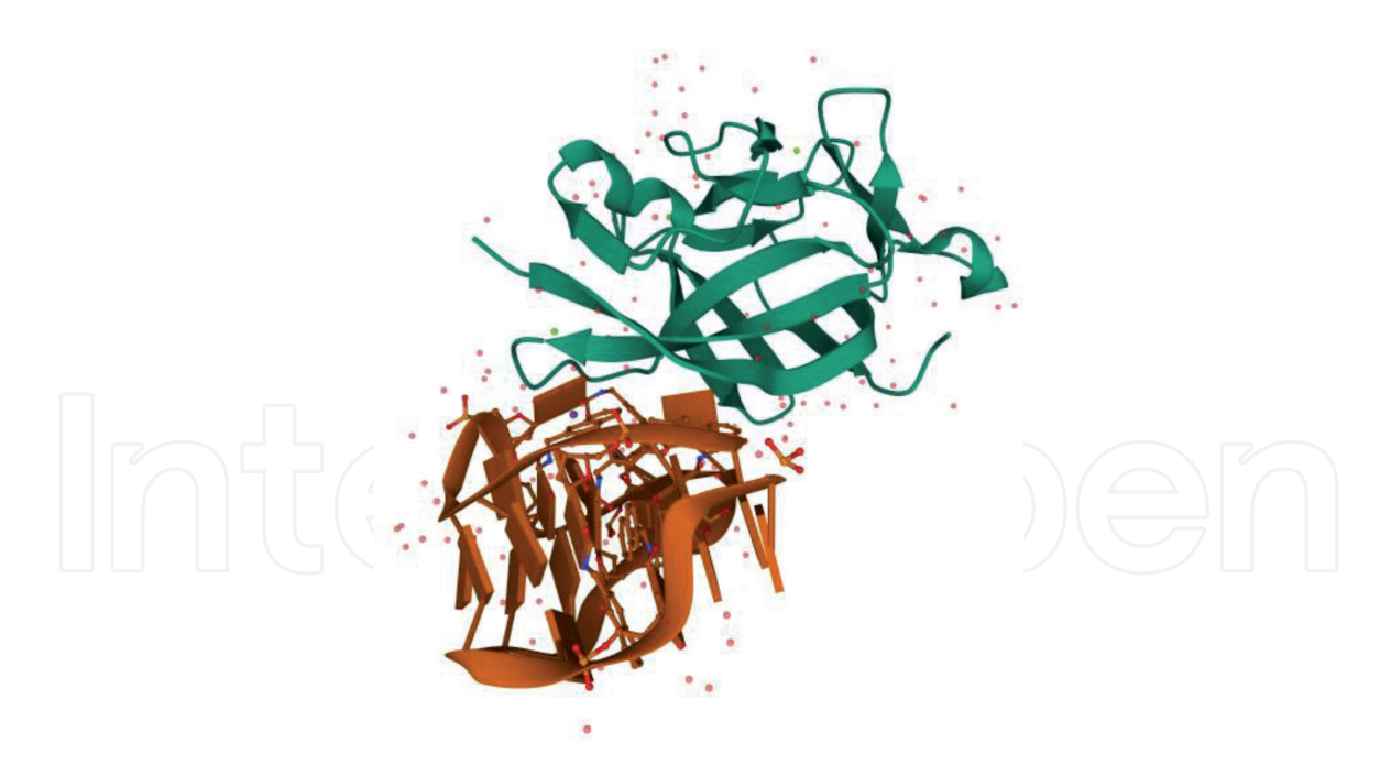
Figure 1. The IL-1 \alpha structure including an \alpha -helix, \beta -sheets and loops (shown in green color) (PDB ID 5UC6) [33].