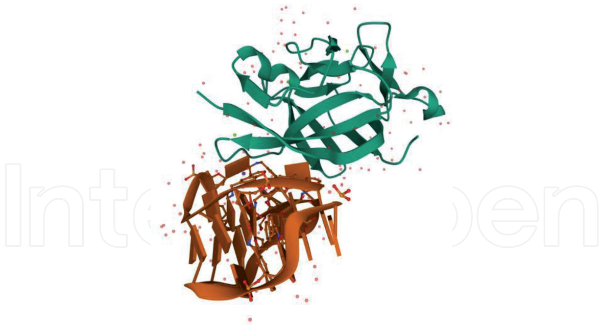
Figure 1. The IL-1 \alpha structure including an \alpha -helix, \beta -sheets and loops (shown in green color) (PDB ID 5UC6) [33].